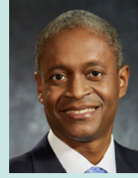
Dr. Raphael Bostic President and CEO Federal Reserve Bank of Atlanta